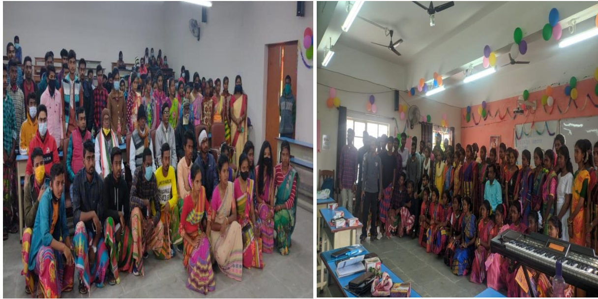
Students and Faculty members with the local Santali literary personalities during the Santali Language Day celebration, 2021