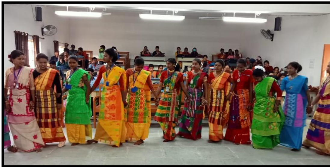
Fig 4: Students dancing to Santali folk song on the occasion of Santali Language Day celebration (2022). Santali Bhasa Diwas organized by the cultural committee give an opportunity to the students to actively participate and gain cultural awareness.