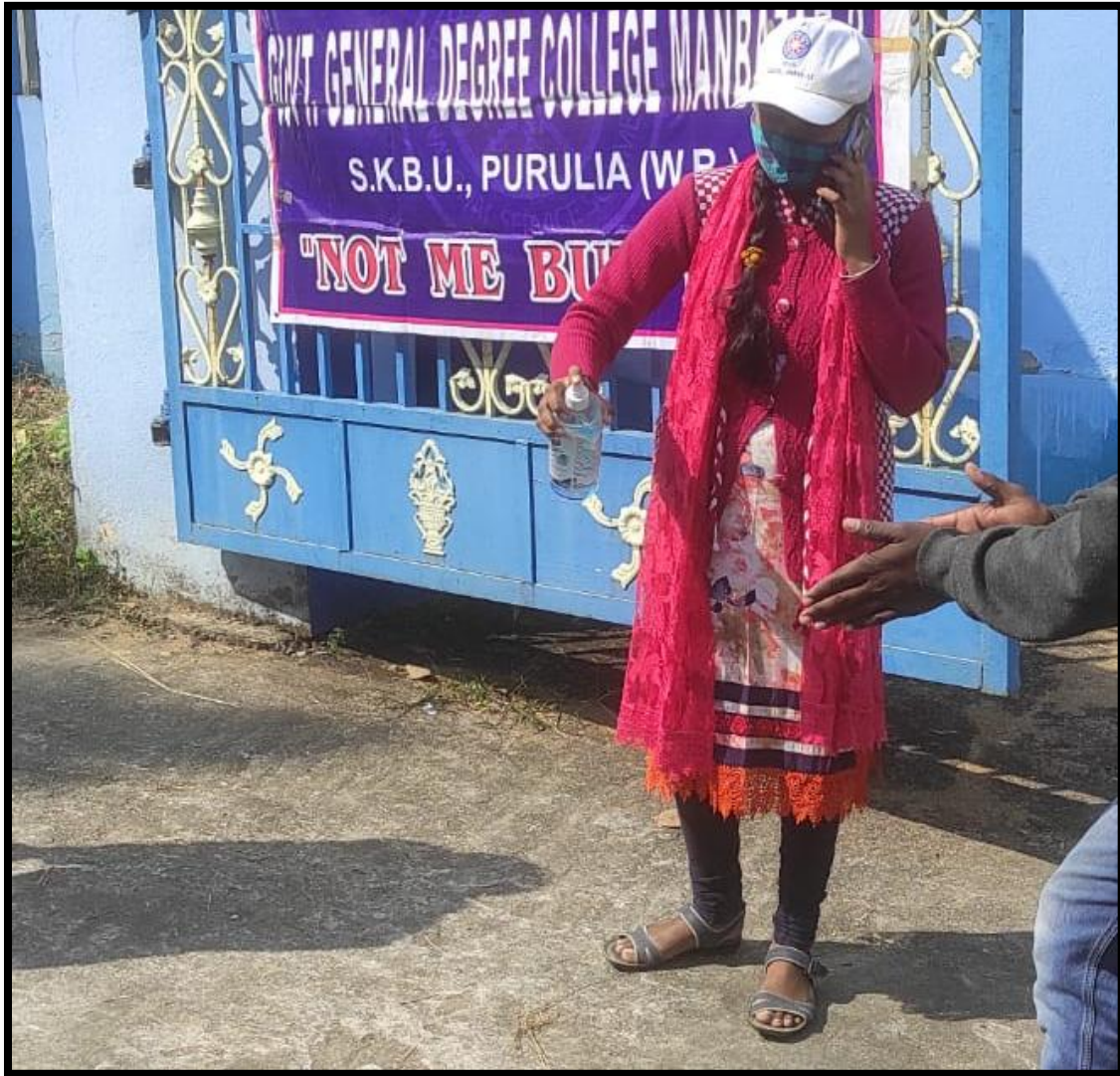
Fig 9: NSS volunteers helping to follow Covid protocols (03.02.2022).

Officer-in-Charge Govt. General Degree College Manbazar - II Susunia, Kumari, Purulia