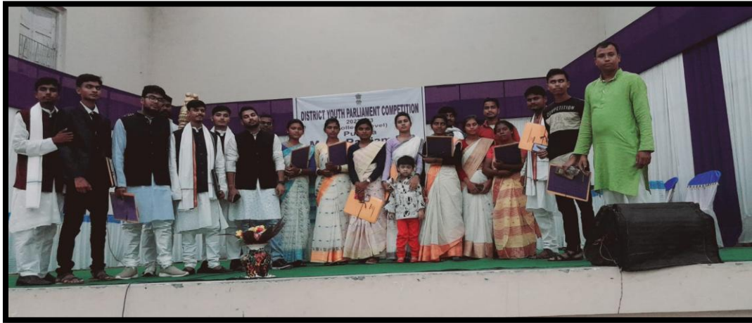
Fig 5: Students taking part in district level Youth Parliament competition (2022-2023).