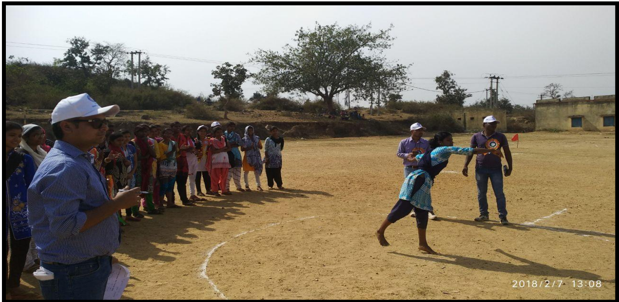
Fig 6: Female students taking part in annual sports in 2018.