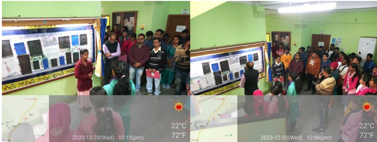
Fig 15: 3 rd time of publication of the college wall magazine 'BIRBURU' by THE OIC in presence of faculties and students. (20.12.2023). Students have taken an active interest not only in submitting articles but also in designing the wall magazine, teaching teamwork.