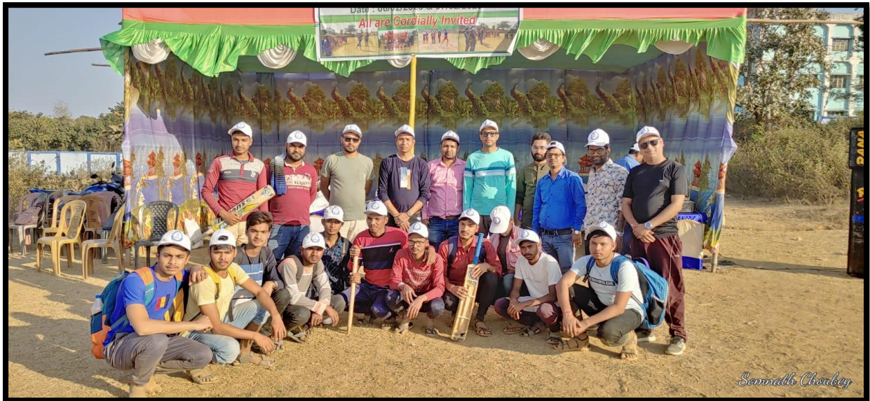
Fig 8: Winning team (Cricket) with the faculty members in annual sports day (2022).