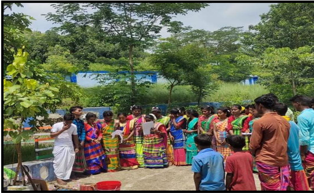
Fig 3: Hul Diwas celebration organized by Santali department (2022).