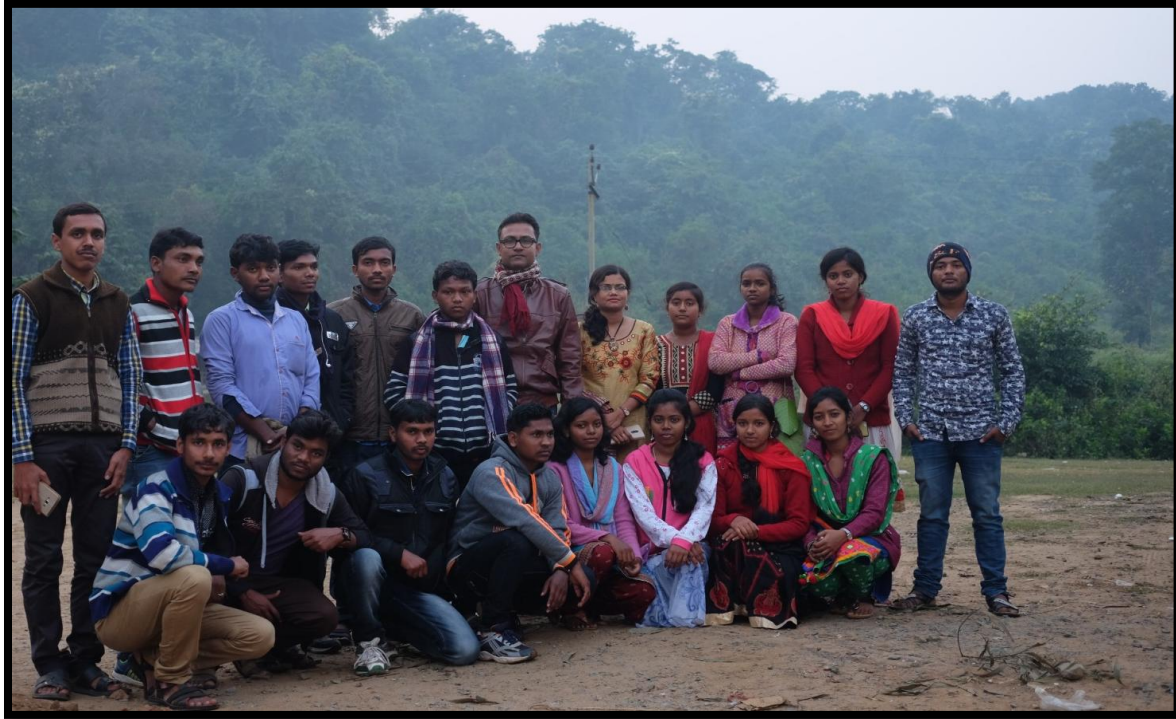
Fig 1: Student excursion to Duarsini organized by English department (2018).