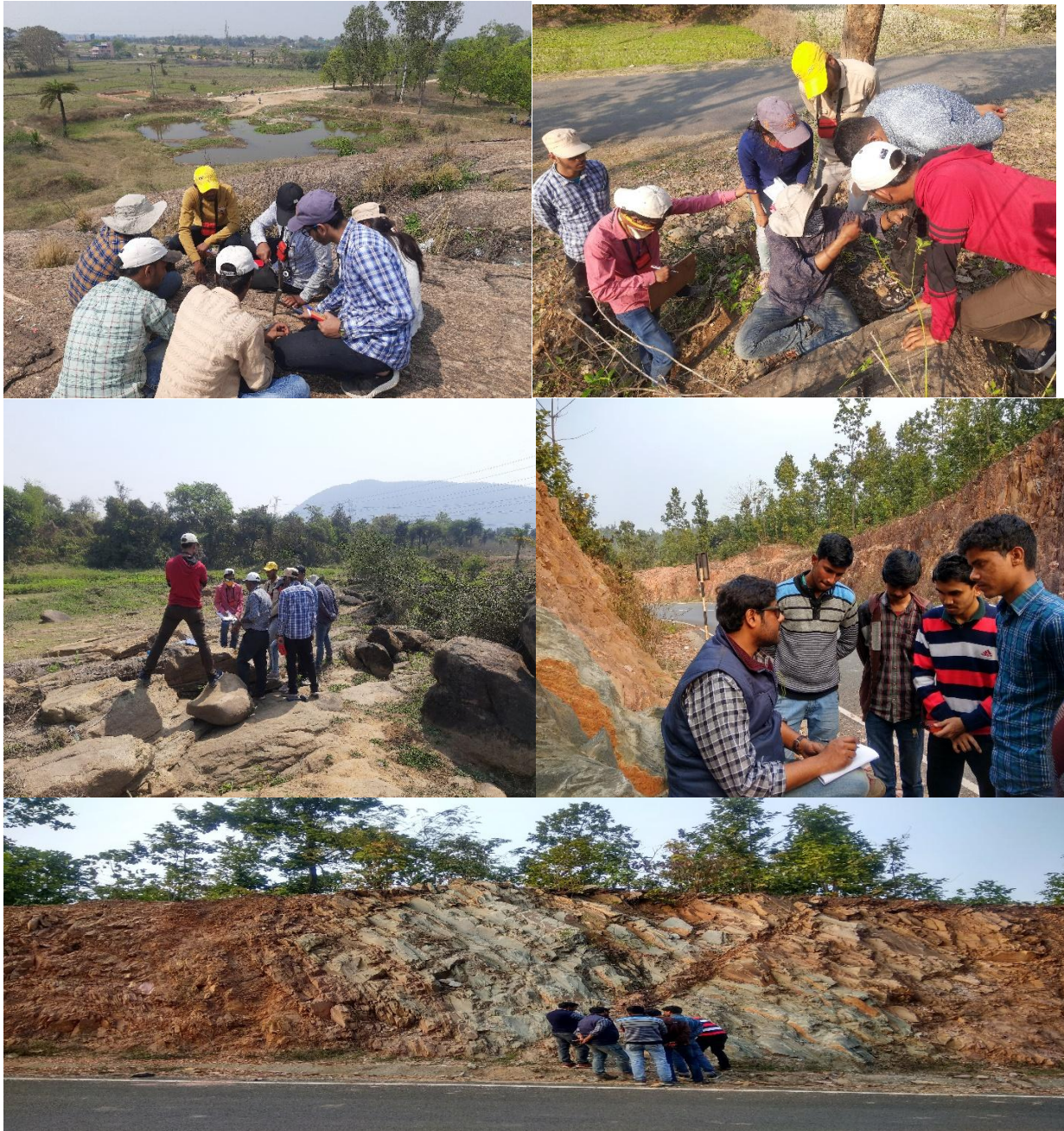
Fig 2: Teacher from the department of Geology helping the students in identifying different geological structures and rocks in the field.