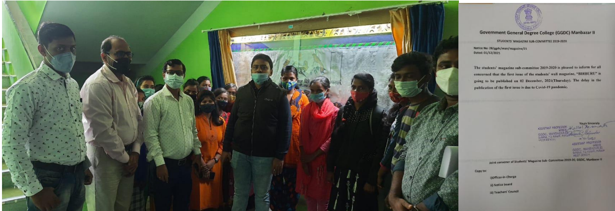
Fig 13: inauguration of the college wall magazine 'BIRBURU' by THE OIC in presence of faculties and students. (02.12.2021)