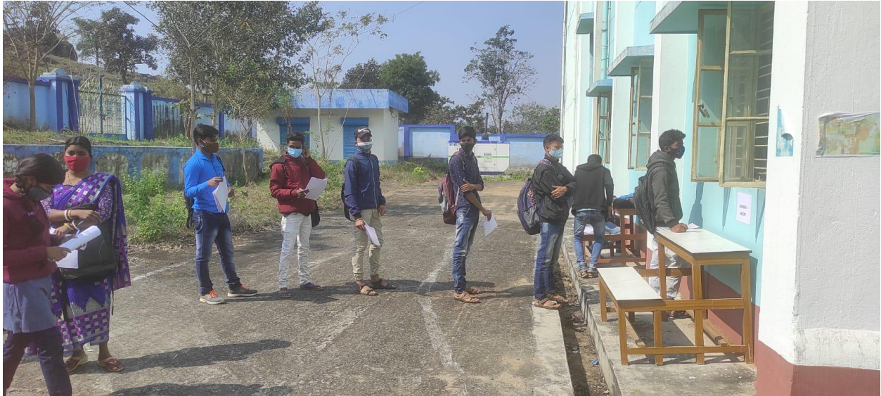
Fig 9: NSS volunteers helping to maintain social distance during exam answer scripts submission, February,2022.