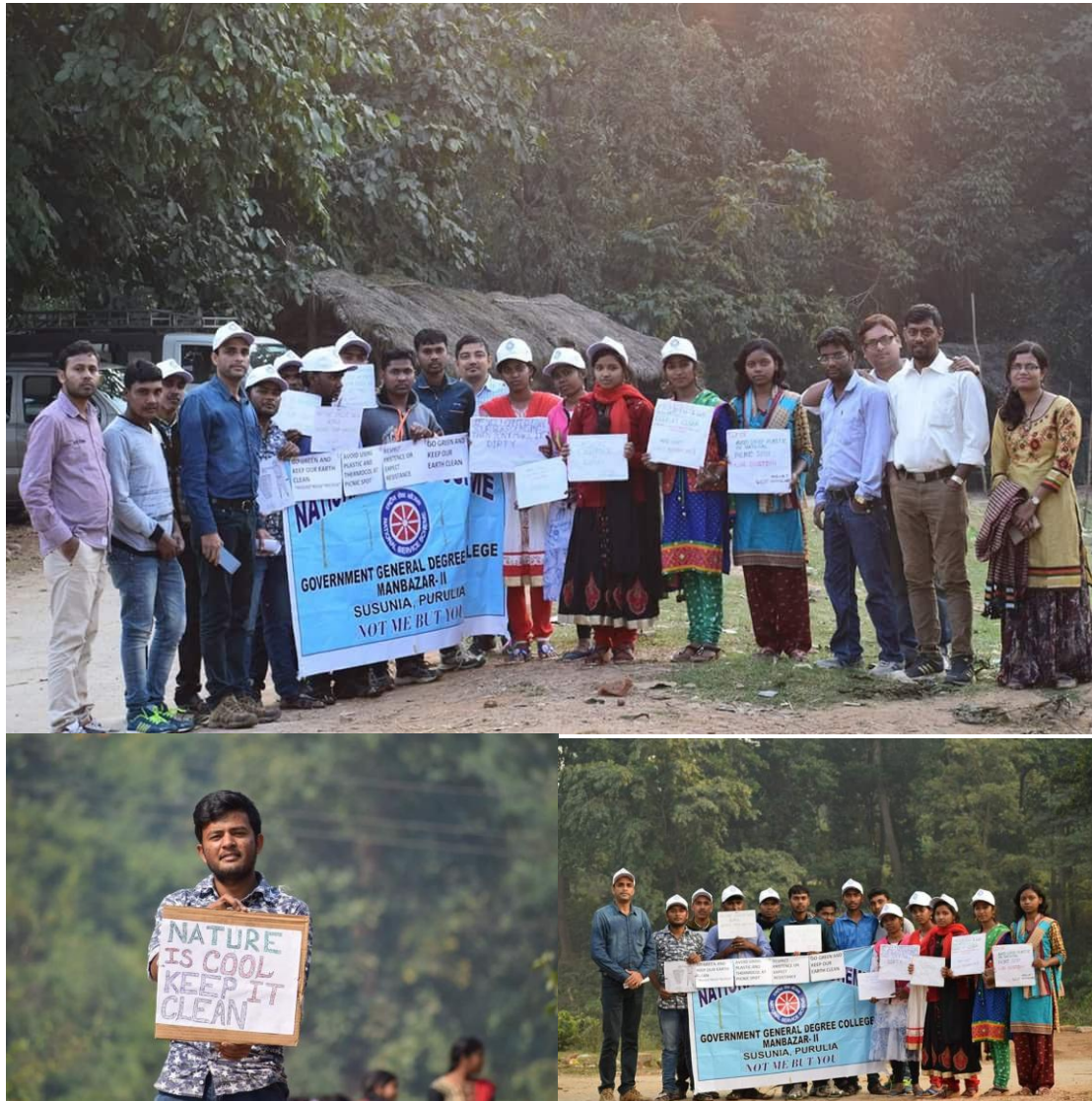
Fig 17: Students are encouraged to actively engage themselves in beyond campus activities. Awareness Program against use of Plastic at Picnic Spot of Duarsini (14.12.2018):

Officer-in-Charge Govt. General Degree College Manbazar - II Susunia, Kumari, Purulia