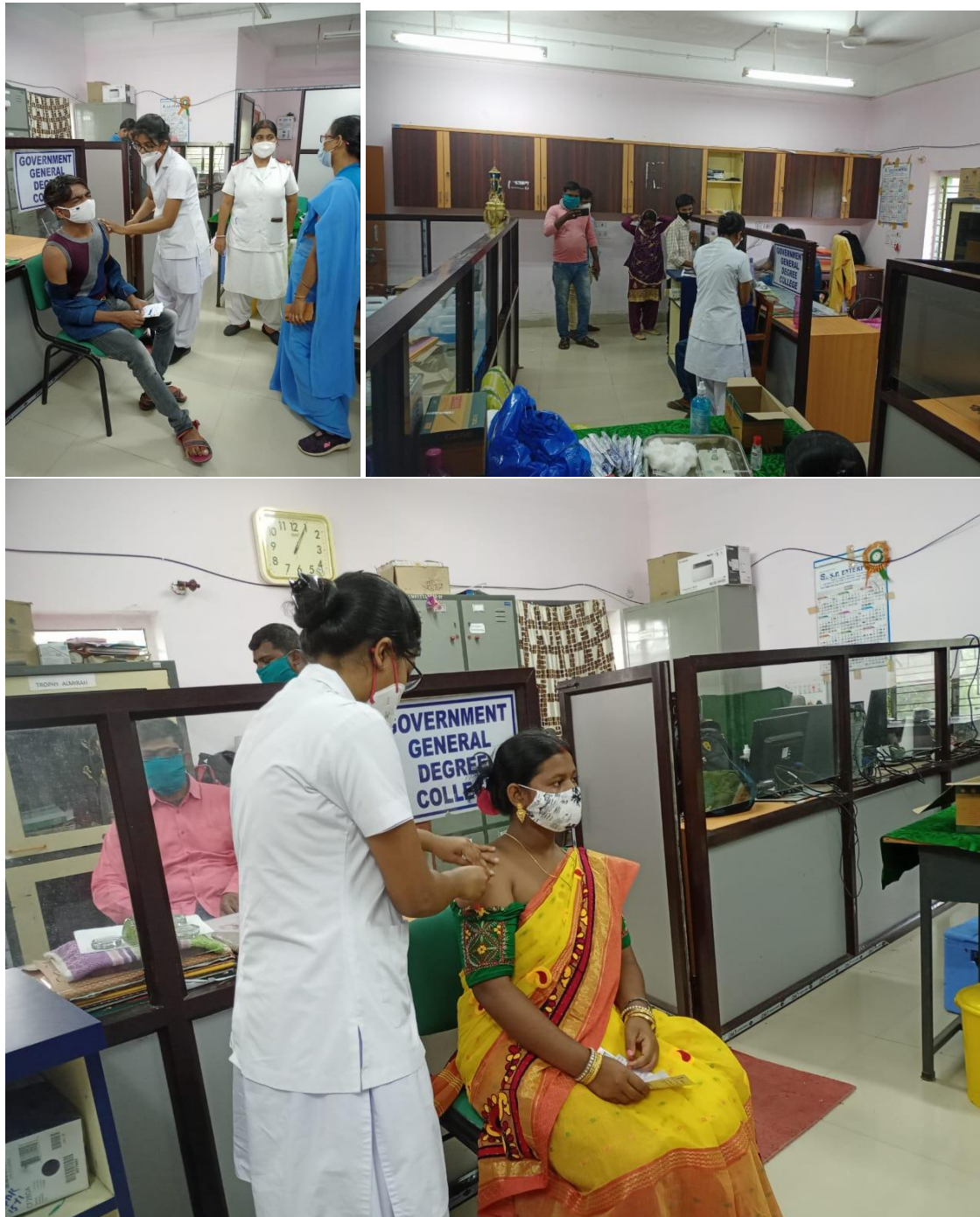
Fig 12: Arrangement of COVID vaccination at the college campus for college students and Local community. During the COVID-19 pandemic, GGDC functioned as a vaccination center where the NSS unit assisted the government vaccination team by overseeing hand sanitization and conducting temperature checks at the college entrance gate.