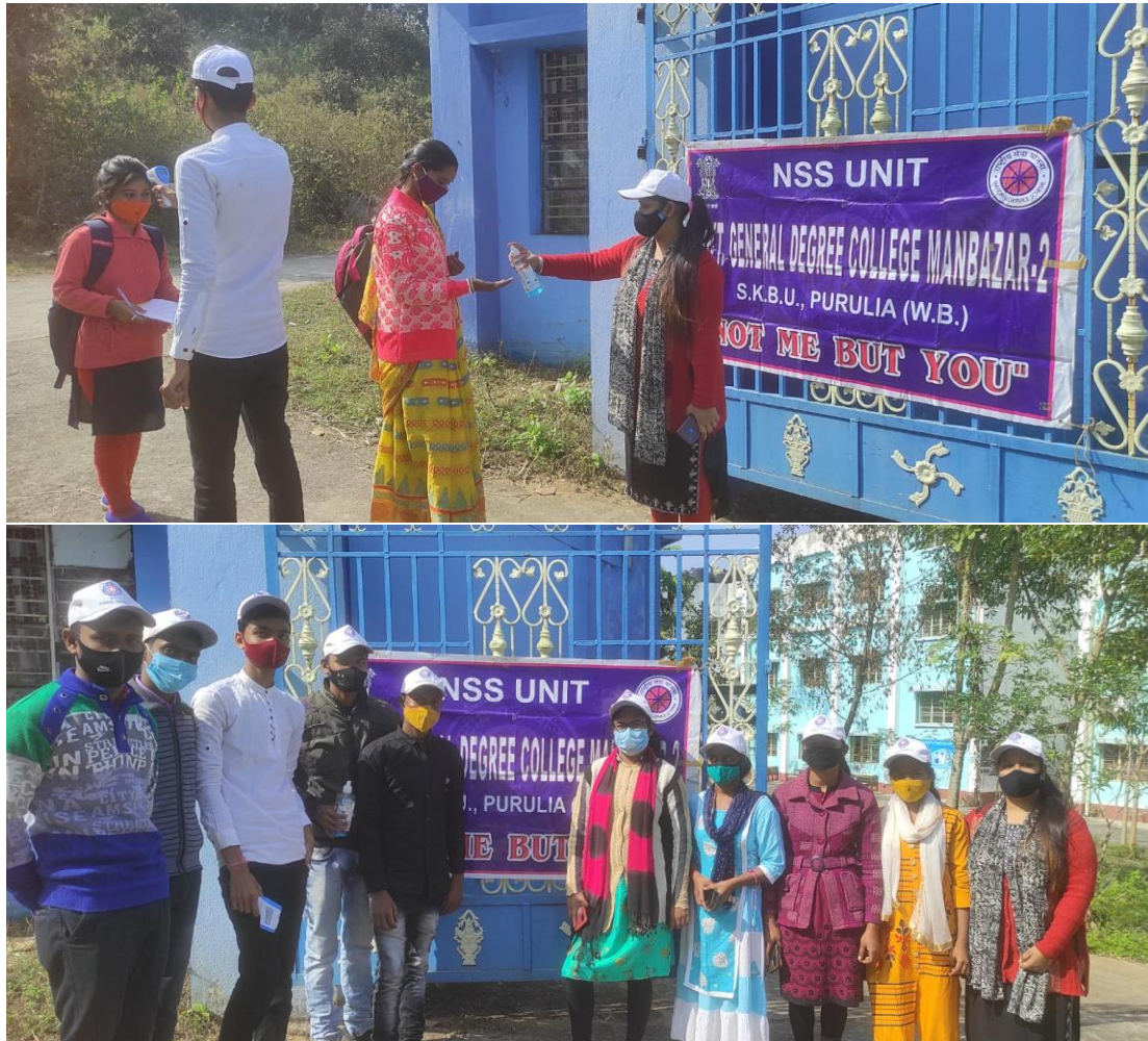
Fig 11: NSS volunteers helping to follow Covid protocols by hand sanitization at the college entrance. (03.02.2022).