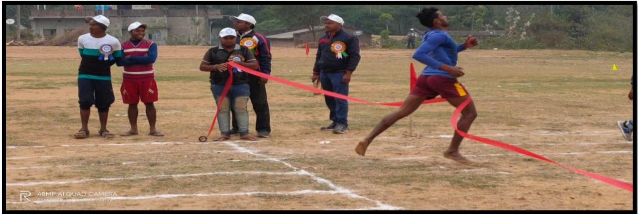
Fig 7: Male students taking part in annual sports day (2018).