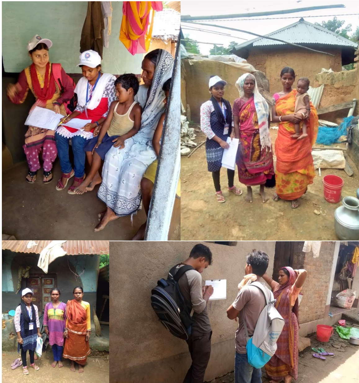
Fig 16: Our institution takes pride in actively engaging students in various extracurricular activities like engagement with the community.